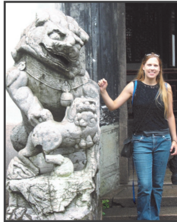
Yuyuan Garden (Shanghai)