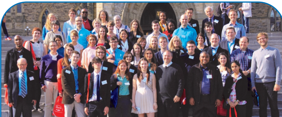
2013 Orientation Participants: in front of the Parliament of Canada

Please keep us informed about all of your successes, and share them with your colleagues and with future Fulbrighters. Also, please give some thought to applying for our various alumni programs and grant enhancements.