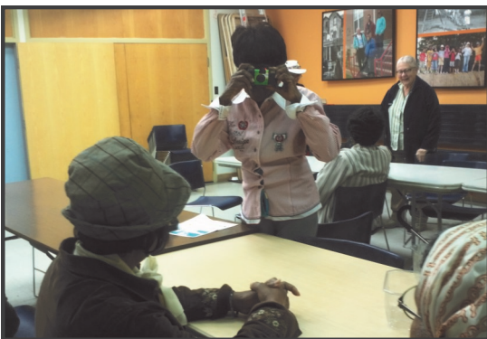
Voices of the City photography workshop for seniors.